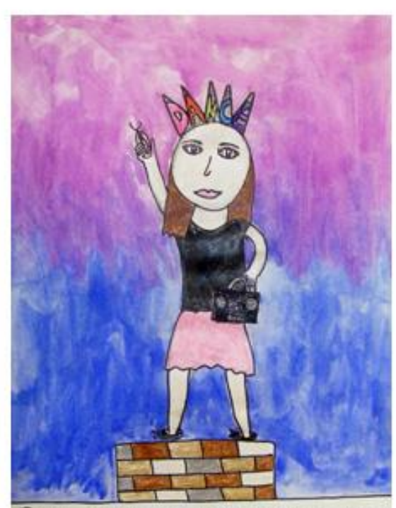
Dance is important to me because its really fun. I like it alot. Whenever I